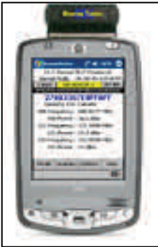
BT100 406MHz Tester