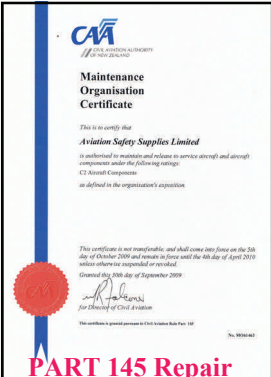
PART 145 Repair Facility for ELT's