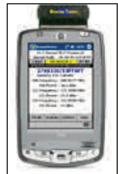
BT100 406MHz Tester