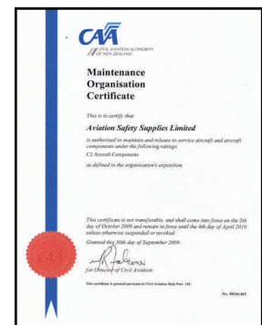
PART 145 Repair Facility for ELT's