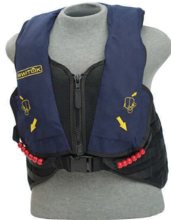
Switlik X-Back Front & rear Views